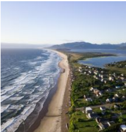
Oceans and Coasts