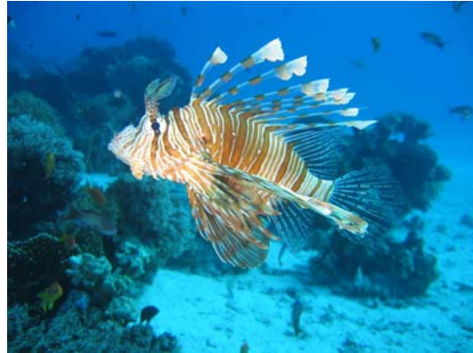
Fish, coral reef