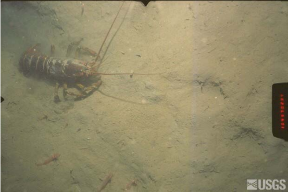
Muddy, shallow water