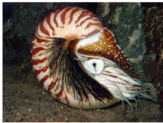
Nautilus, open water