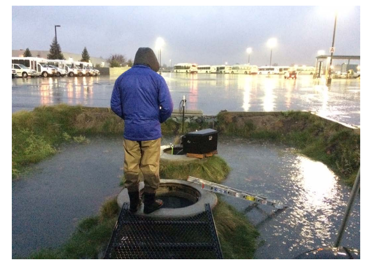
A vegetated pretreatment feature (grassy swale) with dry well in center.