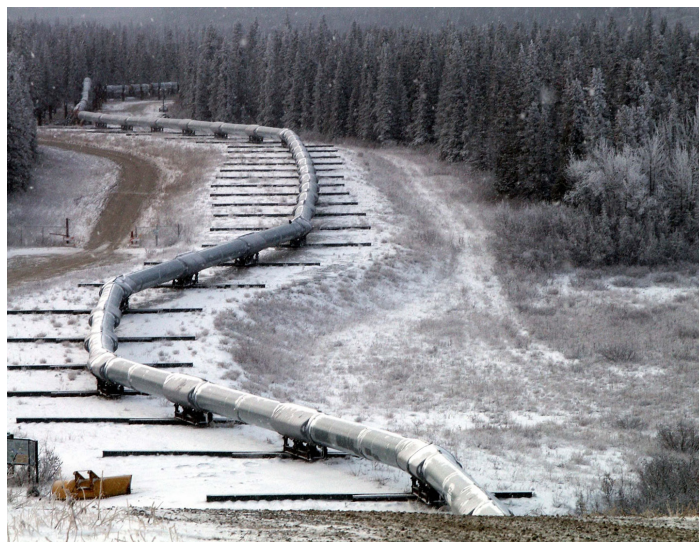
The Trans-Alaska oil pipeline is mounted on sliders where it crosses the Denali fault. During a large (magnitude 7.9) earthquake in 2002, this system allowed the pipeline to move without breaking. Image credit: Tim Dawson, U.S. Geological Survey 25

North Slope oil is collected by a network of local pipelines and then sent 800 miles through the Trans-Alaska Pipeline System (TAPS) to the south coast of Alaska. Except for small quantities refined in Alaska, most of the oil is loaded onto tankers and shipped to refineries on the West coast or occasionally in Hawaii. In areas where the soil is either permanently frozen (permafrost) or never freezes, the Trans-Alaska Pipeline is buried; in areas where the ground freezes and thaws with the seasons, the pipeline is generally elevated above ground. 21 Where highways, animal crossings, or unstable hillslopes required pipeline burial in unstable permafrost, insulation or refrigeration is used to keep the ground cold. 22 Safety features include systems that monitor variations in pipeline flow and pressure to alert response teams