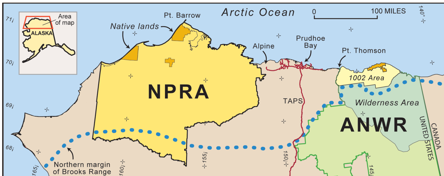
Oil and gas in the North Slope region of Alaska (north of the dotted blue line). Red lines are pipelines. Federal lands include the National Petroleum Reserve-Alaska (NPRA) and the Arctic National Wildlife Refuge (ANWR), which includes wilderness (darker green) and 1002 (light yellow) areas. 4 See text for more information about the features in this map. 5

area of the National Petroleum Reserve-Alaska (NPRA), and offshore. 3 Concerns over increased environmental risks in a region already experiencing rapid environmental and climatic changes are often weighed against the economic benefits of increased exploration and production. Attempting to balance these priorities, the National Environmental Policy Act (NEPA) requires that, before any exploratory studies are authorized, federal agencies must consider impacts on sociocultural, economic, and other natural resources in consultation with other government agencies and the public.