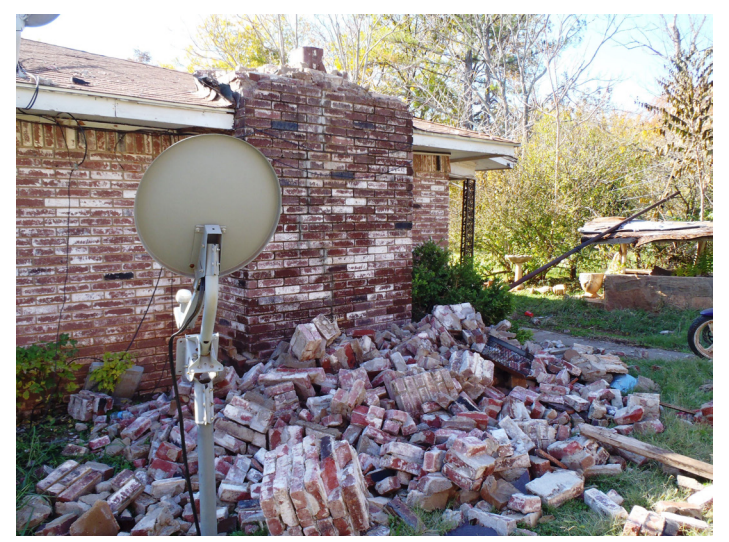
Damage caused by the magnitude 5.7 earthquake near Prague, Oklahoma, November 6, 2011. Unreinforced stone and brick buildings (especially chimneys) are some of the most vulnerable structures in any earthquake.<sup>10</sup>